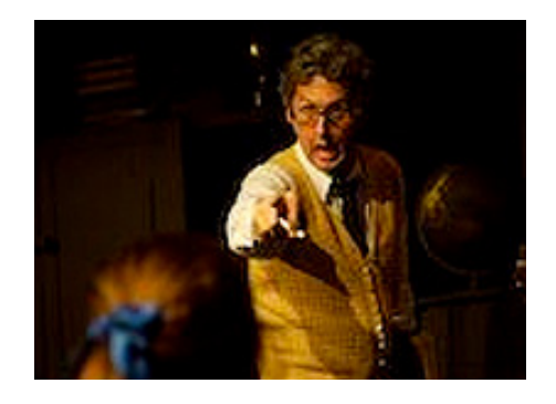
The Lesson Written by Eugène Ionesco

"This play is a must see" ★★★★ Remote Goat