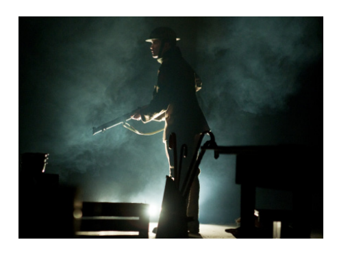
Journey's End Written by R.C. Sherriff

An Icarus Theatre Collective & Original Theatre Company co-production (National Tour 2010)