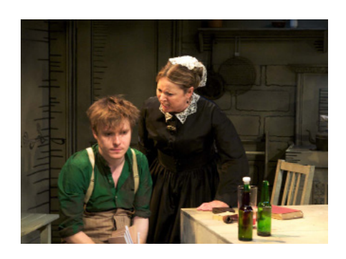
Vincent in Brixton Written by Nicholas Wright

An Icarus Theatre Collective & Original Theatre Company coproduction (National Tour 2009)